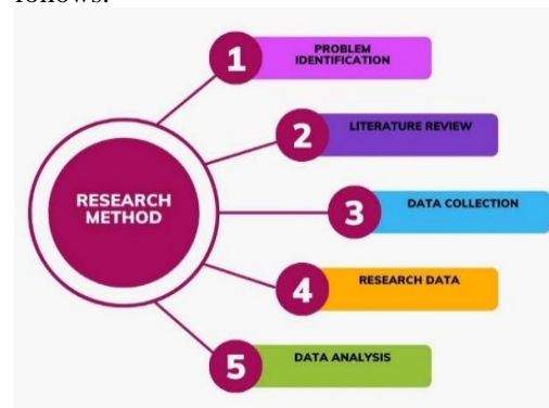
Figure 1. Research Method

The stages in this research are described as follows: